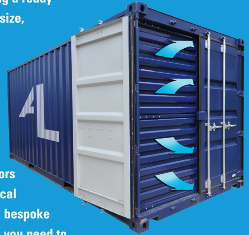
Optional secure louvre door for ventilation

Arden Lea are not only field irrigation specialists with almost 40 years experience, but are also expert fabricators with their own fully fitted workshops and NICEIC electrical installers. So Arden Lea are uniquely placed to deliver a bespoke containerised irrigation room fully fitted with everything you need to be sure of delivering exactly the right fertiliser recipe to your crop.